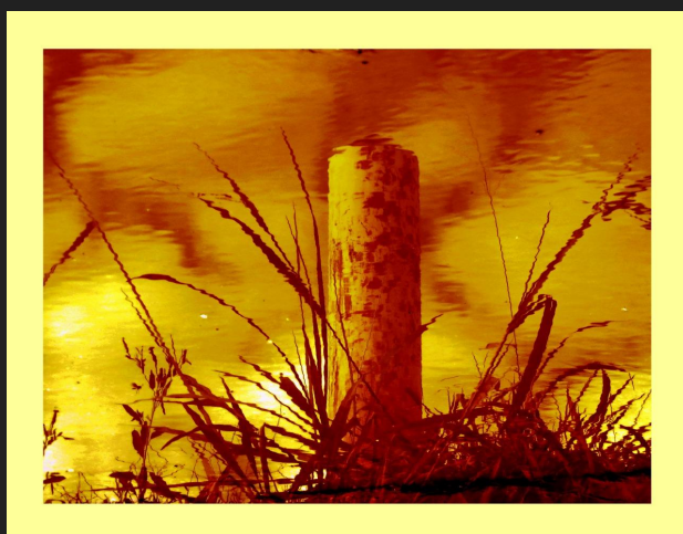
Sensação de solitude Itaipuaçu (40x60cm) R$ 2.000,00