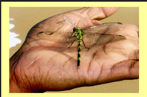
Libélula na mão, praia de Itapuã Salvador (40x60cm) R$ 2.000,00