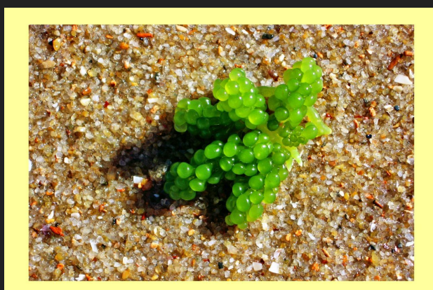
Uva do mar, praia de Gaibu Pernambuco (40x60cm) R$ 2.000,00